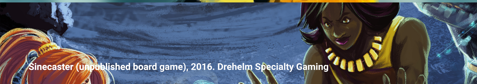
Sinecaster (unpublished board game), 2016. Drehelm Specialty Gaming